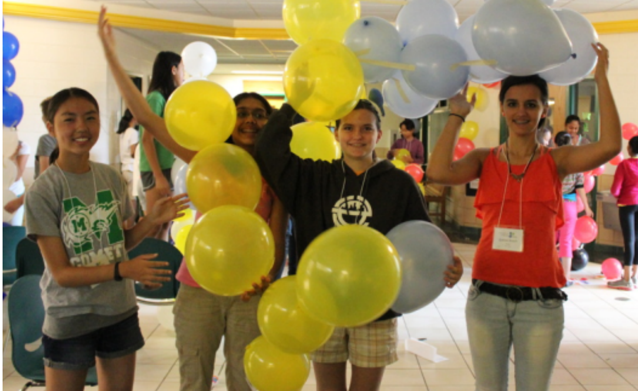
Balloon Tower Activity

Each of the final project groups was led by a high school mentor and was faced with the challenge of designing and coding a project in Scratch that addressed a social issue. We purposefully left their challenge open-ended and relied heavily on our high school mentors, all of whom had spent at least three weeks prior to the beginning of the camp learning Scratch, to provide individual instruction and guidance. Through our own experience in programming classes, we knew that the most exciting part of computer programming was having the freedom to be creative and innovative. We wanted to capitalize on the fact that computer programming, unlike many other subjects, allows even beginners to see the potential and power of a their own computer programs immediately.