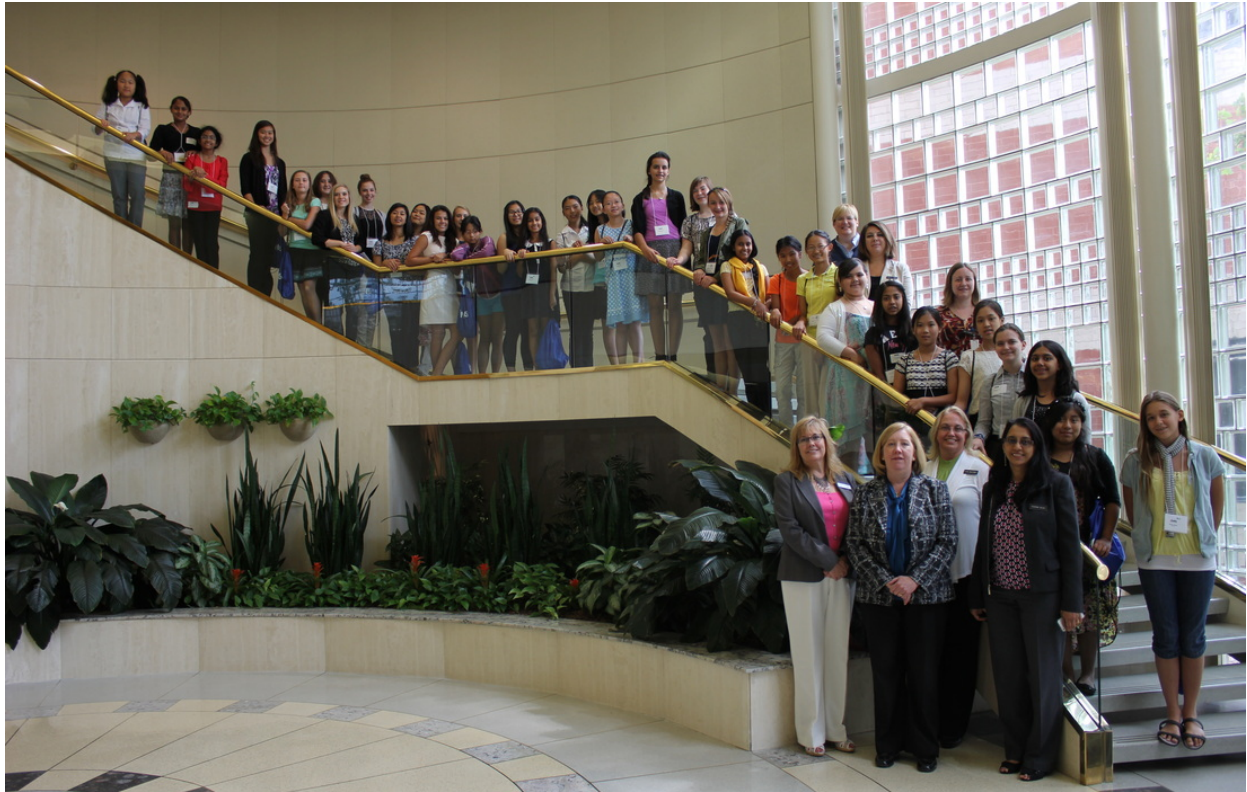
Field Trip to Cintas Corporation

In order to teach the girls about jobs in IT, we took them on a trip to Cintas® Corporations' headquarters in Mason, OH. Cintas is a company that provides specialized services such as uniforms, first aid supplies, and fire protection services to a variety of businesses. During the visit, the girls were able to meet women who worked in IT at Cintas, and listen to their stories. They were also introduced to how Cintas uses IT to help their customers, for example by creating an app that allows customers to design their uniforms digitally. Many of the girls' favorite part was getting a tour of the control center where we could see IT actually being utilized in Cintas' daily operations.